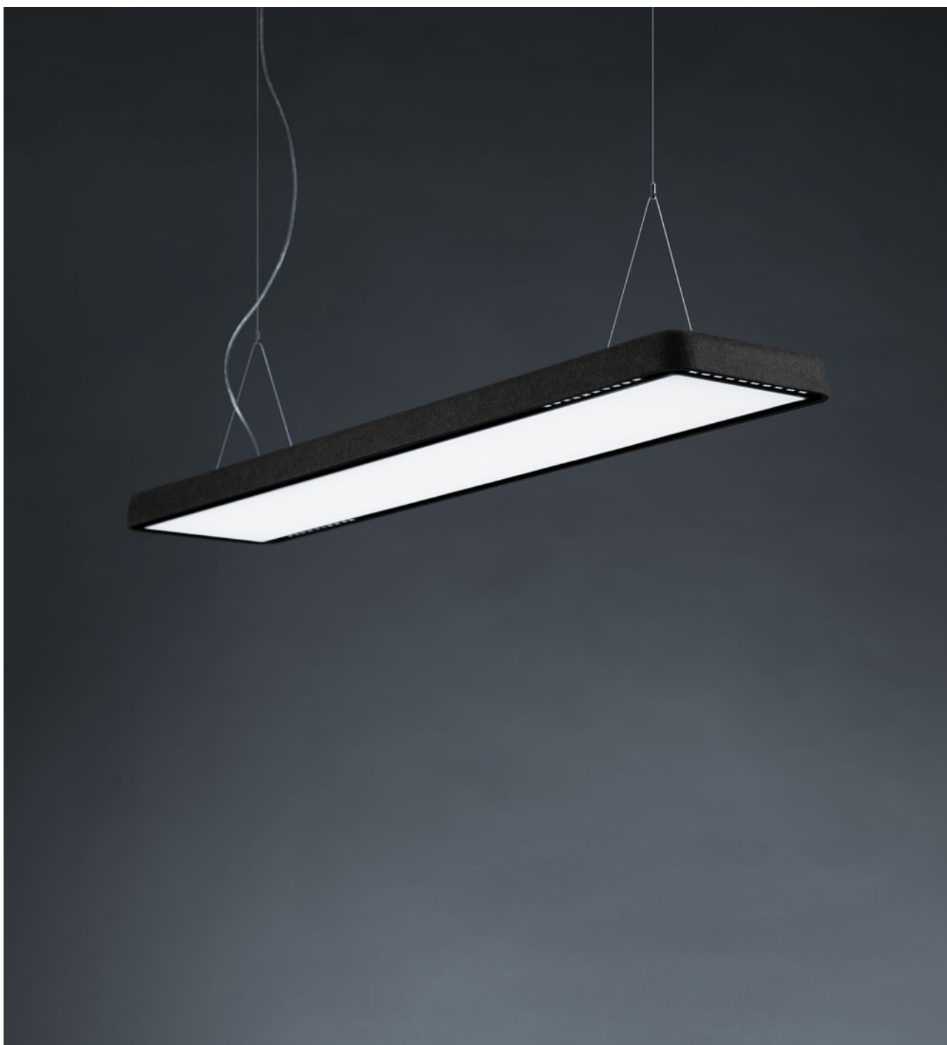
TRAMAO S plus in Anthracite