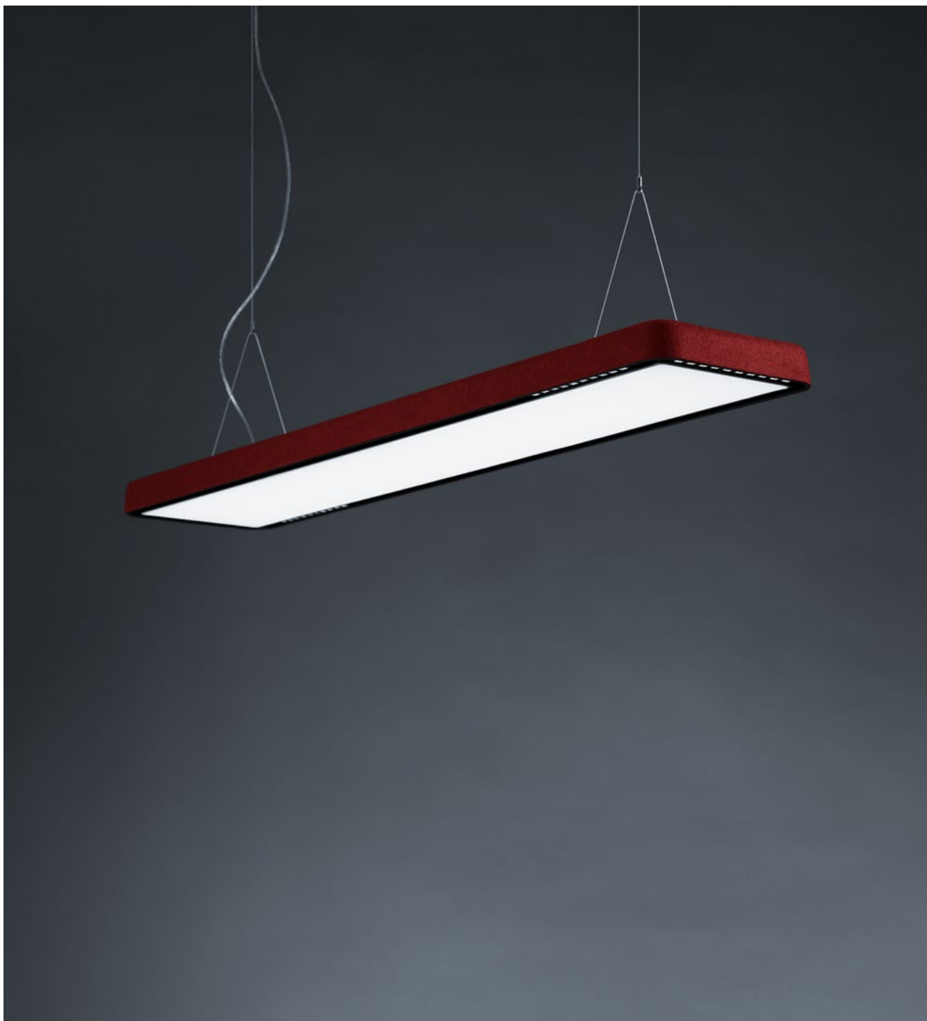
TRAMAO S plus in Burgundy Red