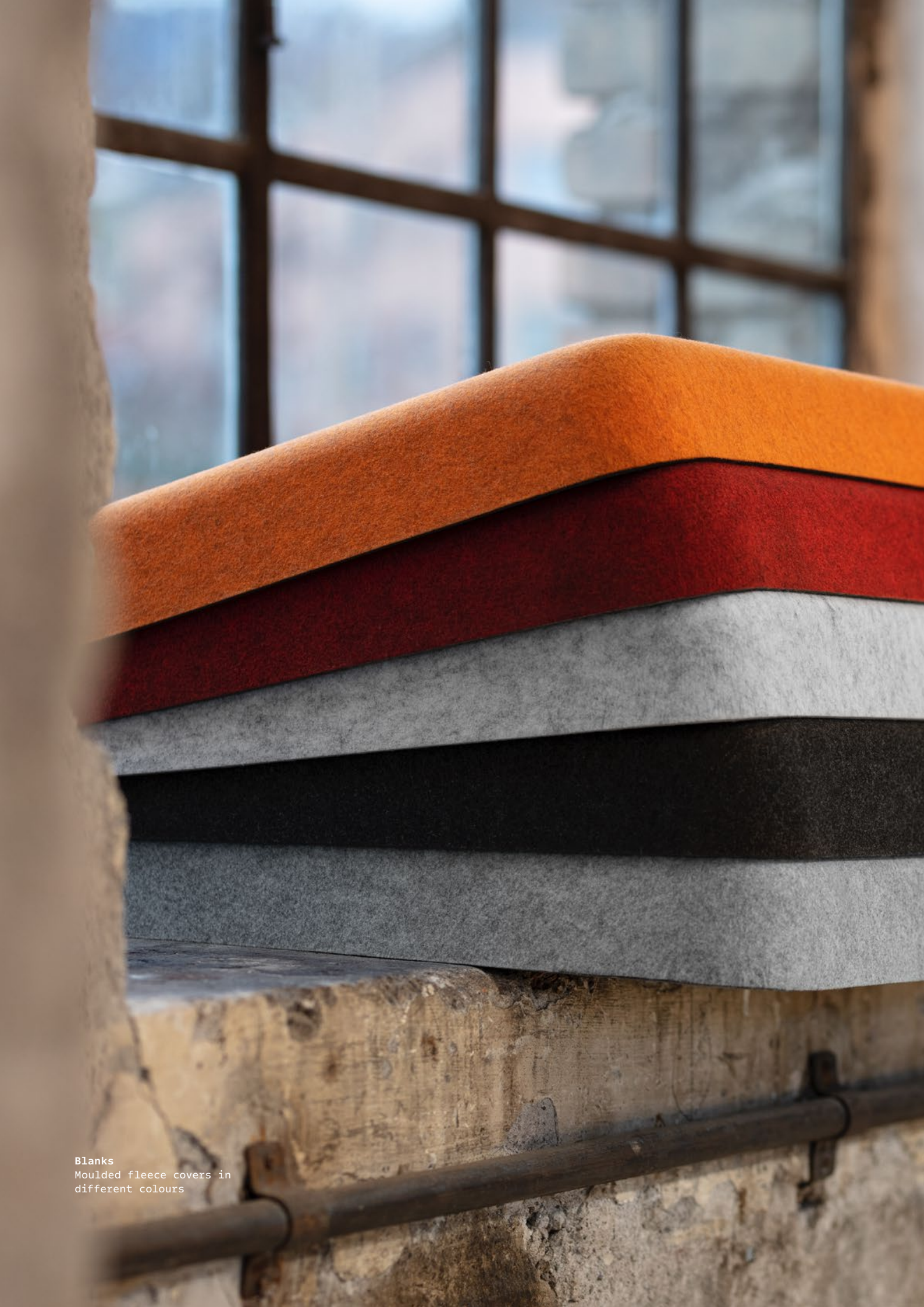
Blanks Moulded fleece covers in different colours