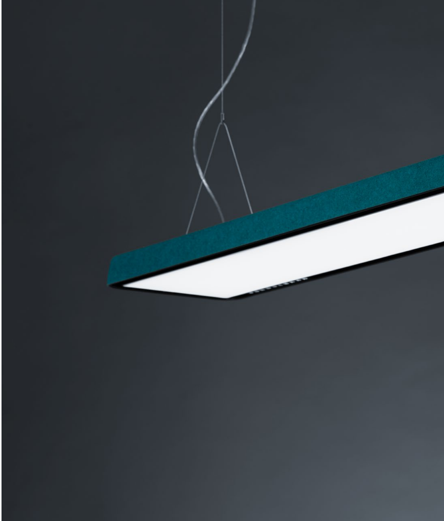
TRAMAO S plus in Vivid Blue